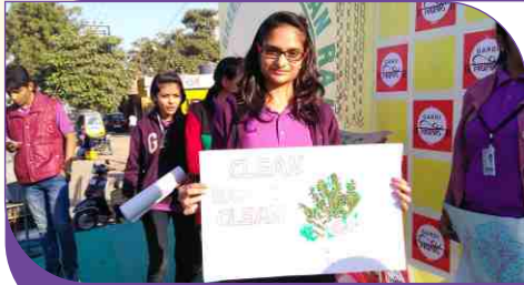
Clean Rajkot Green Rajkot