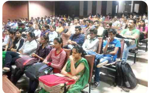
A massive participation by the CSE/IT students (about 188 students)

Faculties and students both were interested in acquiring the knowledge of securing the information from the expert sessions of Oracle Academy.