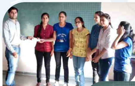
Team ranked first in Competition A