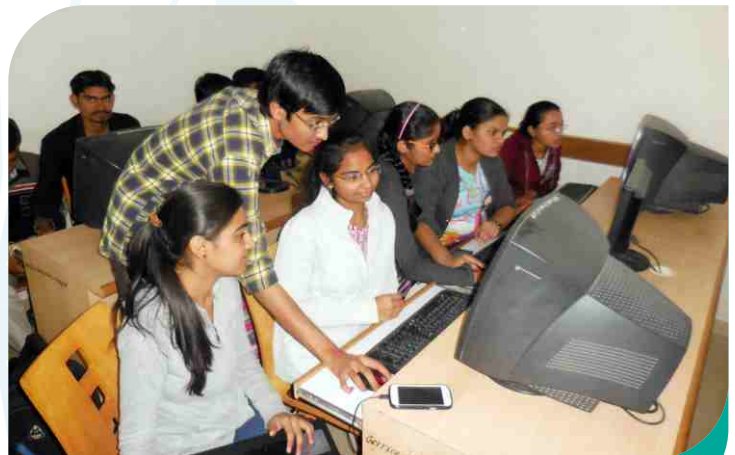
Students Coordinators - the helping hands