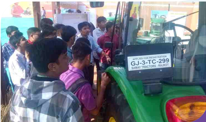
Students exploring the knowledge of advance four wheel technology in tractors

the challenges linked to innovative technology of various sectors which covered all the types of manufacturing industry. Through this visit the students could easily imagine and digest the new technology & development and they can convert the tag of Imagination to Reality.