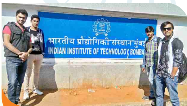
BHGCET Enthusiasts @ IIT Bombay