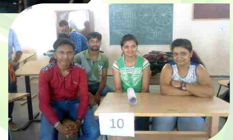
Second ranker in Competition B