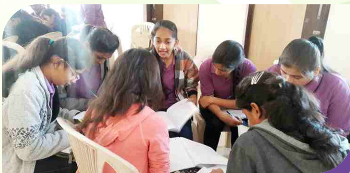
Students enthusiastically working hard to win the "Battle of Code"