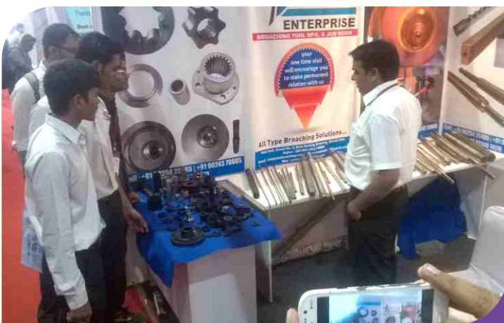
Students' tumble-to process variable of broaching machine