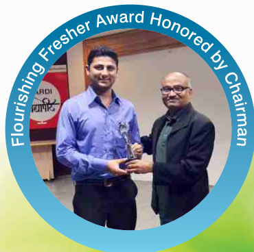
Flourishing Fresher Award Honored by Chairman