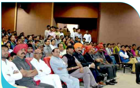
Soldiers of India with Gardi Family