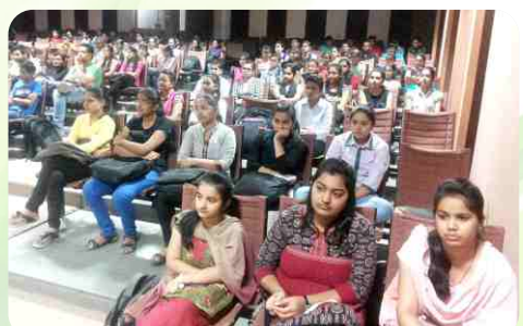
Empowered Women: Girls keen to learn new technologies to protect themselves.