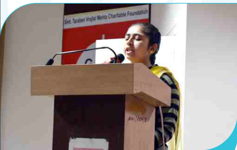
Address to Nation

Gardividyalpith also appreciated all the rank holders of the institute who all are the future of our developing nation.