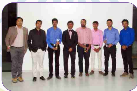
Group Photo with Award Winners