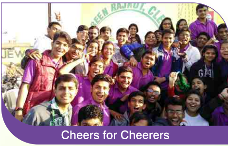
Cheers for Cheerers