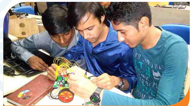
Learning by doing