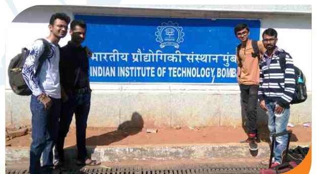
Energised team to showcase their talent