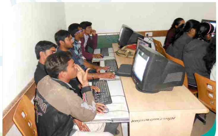
Exploring for Expertise

Content : PCB Designing Workshop Attendees : EC & EE students Rendezvous : January 23rd, 2016 : 10:00 am - 04:00 pm Incharge : Prof. Ankit Raythathha