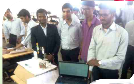
First ranker in Competition B