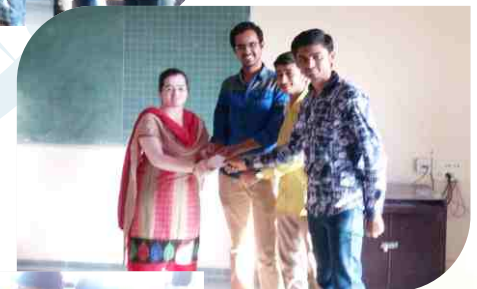
Team ranked second in Competition A