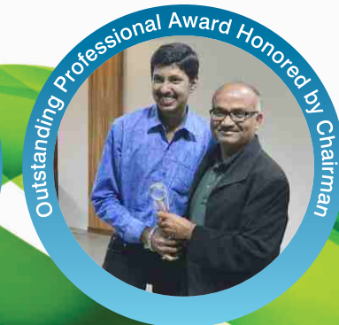
Outstanding Professional Award Honored by Chairman