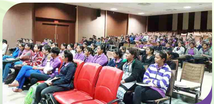
Students curious about learning different spectrums of C language