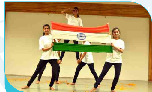
Salute to M