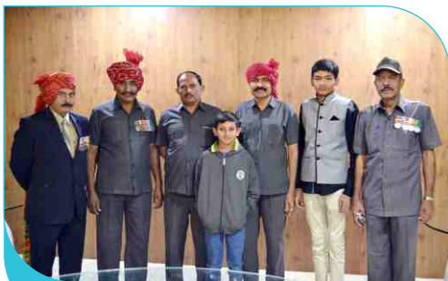
Pride of India @ Gardi Vidyapith