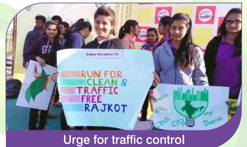
Urge for traffic control