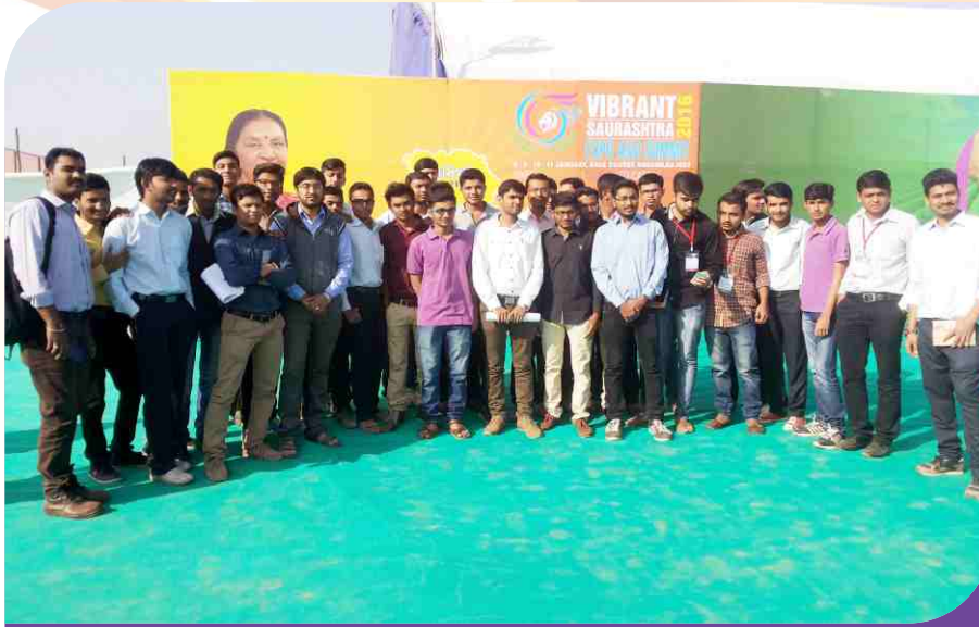
Great initiative - A bridge for students

VSES-2016 expo exhibited latest innovation and information regarding automobile, agriculture, manufacturing, metal fabrication and other various sectors had been displayed which have never been witnessed by people of Saurashtra and its Industry. The aim of VSES-2016 was to build a bridge between Saurashtra industries and other national as well as international