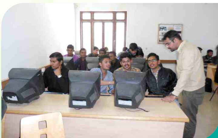
Schematic Design Preparation