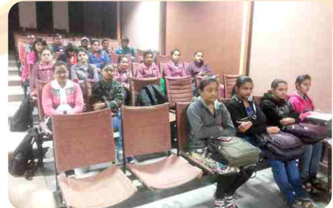
Girls of BHGCET always actively participate for such kind of informative events.

"Code Java Together"-Greenfoot Workshop - held during GTU Techfest 2015 (23 Feb 2015)