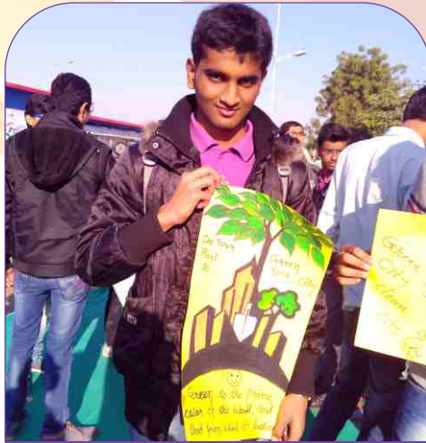
My Smart City