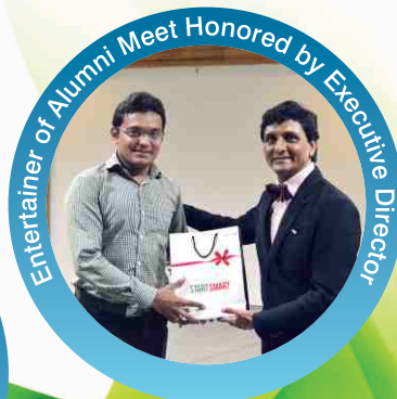
Entertainer of Alumni Meet Honored by Executive Director