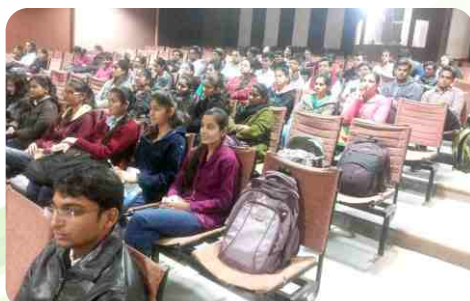
Around 95 students & 3 Faculties benefitted in terms of knowledge from the presentation.

Students learned about Internet of Things which includes collecting and managing the massive amounts of data from a rapidly growing network of devices and sensors.