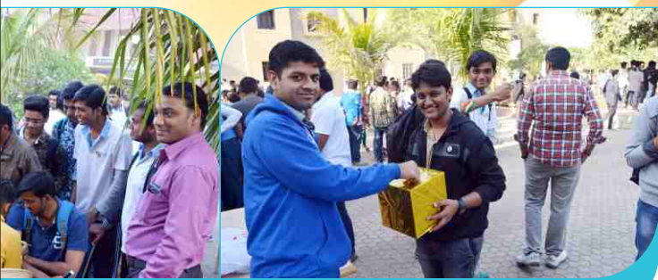
Participating & Contributing for Sainik Welfare Fund