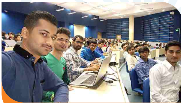
Ready to Ride

After Coding, student runs the robots by laptop keys and also controls the cursor of the laptop by the help of image processing. This Sixth Sense workshop aided them to understand the deep knowledge in their final year project which is "Hand Gesture Wheelchair for disables".